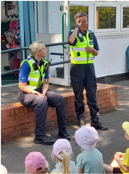
A visit from our PCSO's!